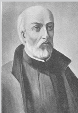
St. John de Brebeuf